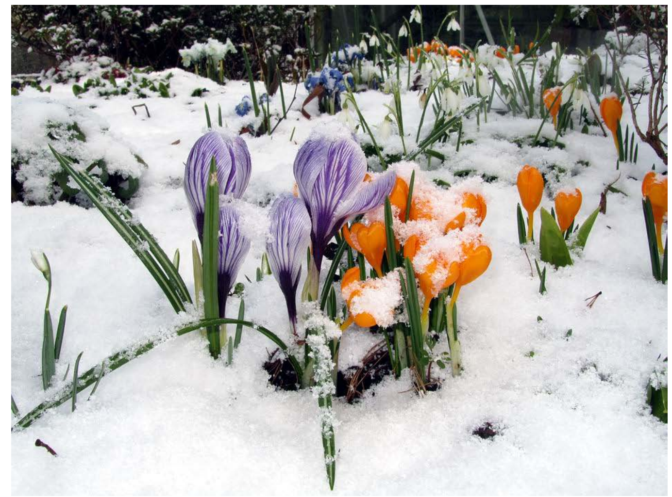
Next morning the snow is back again but these hardy flowers remain unaffected by the daily covering of snow and quickly open their flowers to the slightest rise in temperature.