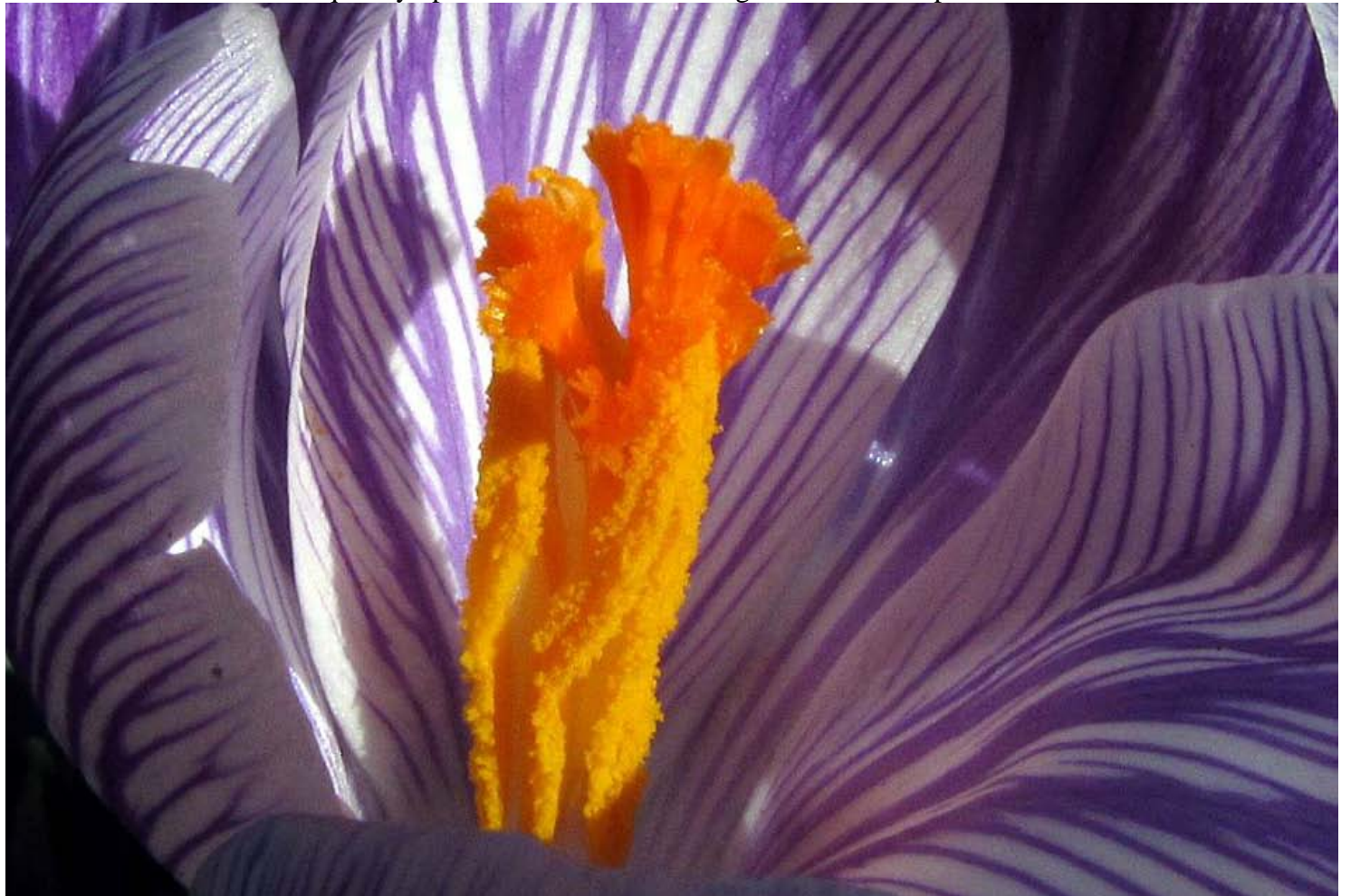
The beauty of this large Crocus is best seen in the contrasting colour and texture combination between of the pollen, style and petals.