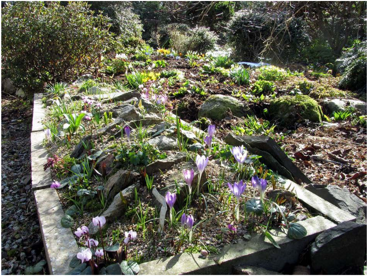
By early afternoon the sun has melted away the snow and the flowers open as the air warms up a bit.