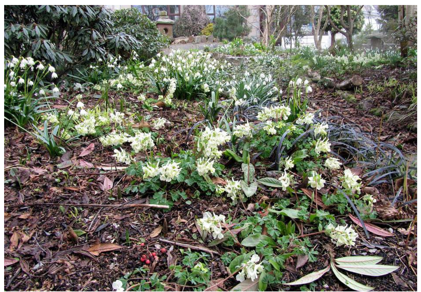
Corydalis, Galanthus and Leucojum