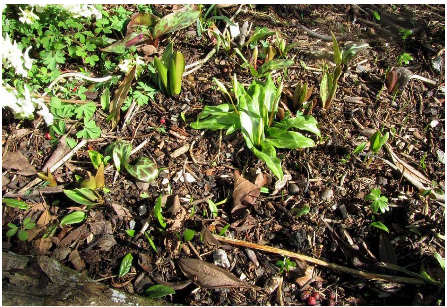
I encourage Erythroniums to self seed all over our garden - in the foreground you will see seedling leaves of varying ages.