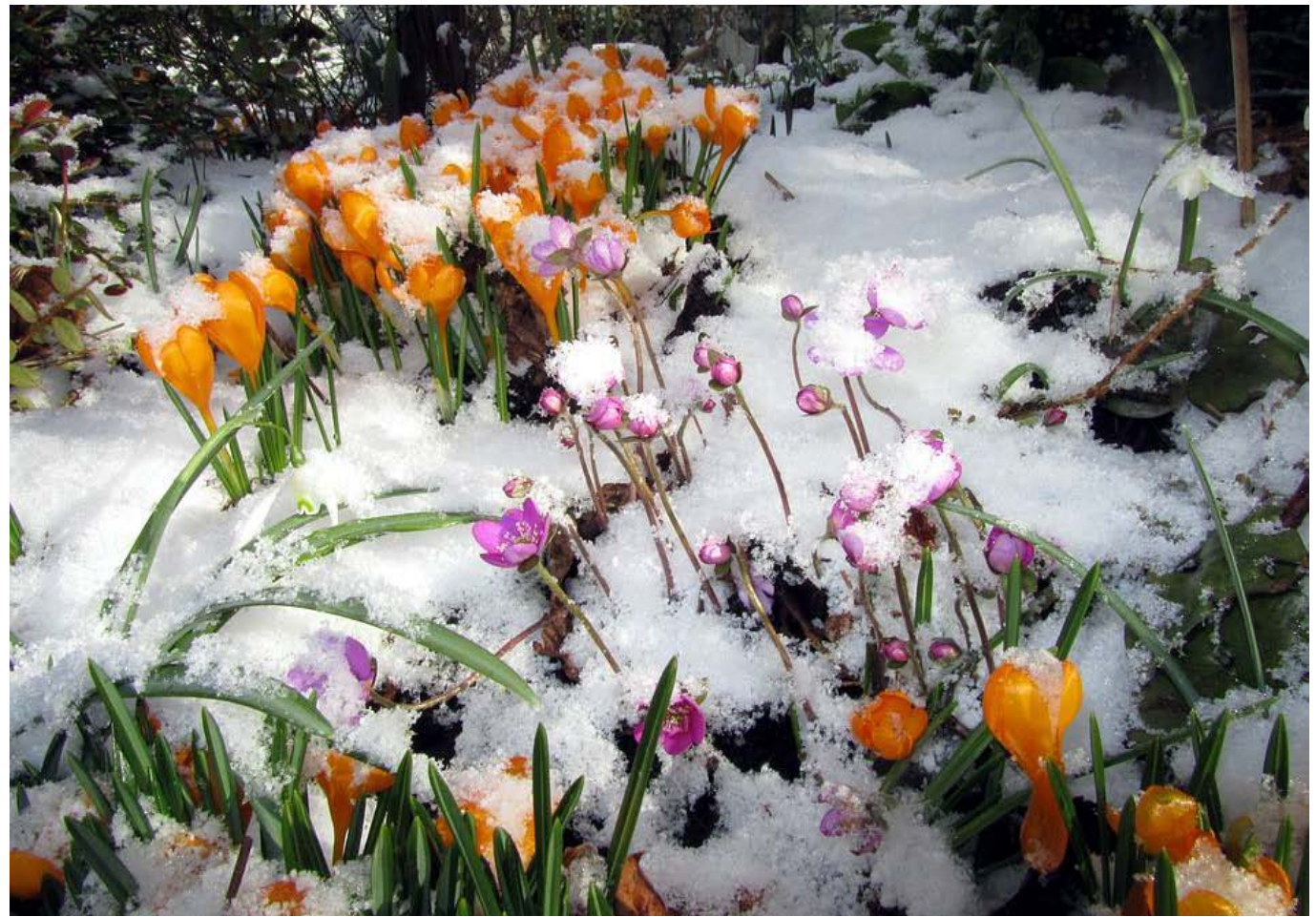
Next morning the snow is back once more covering the ground and flowers – then depending when the sunshine breaks through the snow melts away leaving the flowers, and the gardeners, to enjoy the brief warming of its rays.