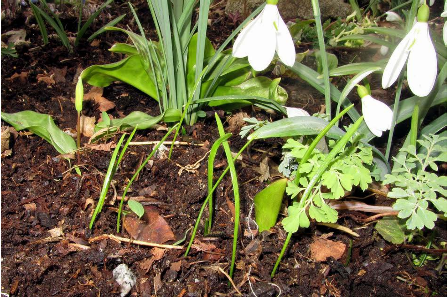
Here you can see a group of Galanthus seedlings germinating where they shed from last year's seed pod near the base of the parent.