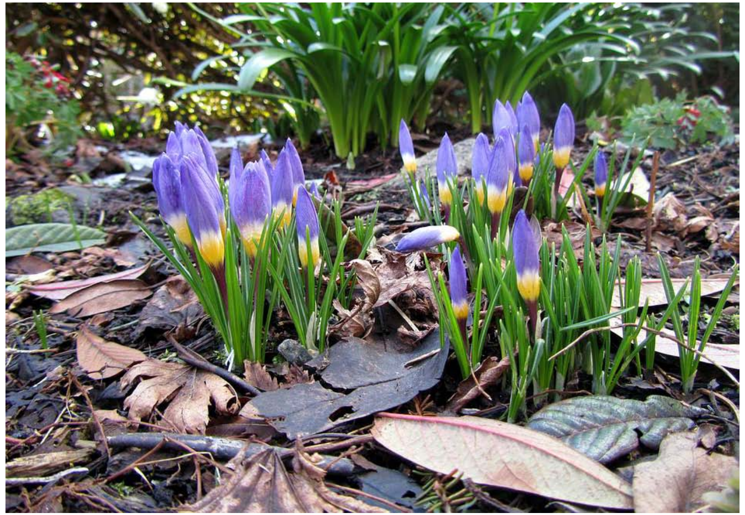
As beautiful as it is this clonal group of Crocus sieberi tricolor has never set any seeds for me. I do not know if it is a sterile clone or that the conditions when it is in flower in our garden have just not been favourable to fertilisation.

Self seeding also gives us mixed groups as you see in this group of Crocus above. I much prefer the visual display of a mixed group to that of a mass planting of a single clone such as the group of Crocus sieberi tricolor below.