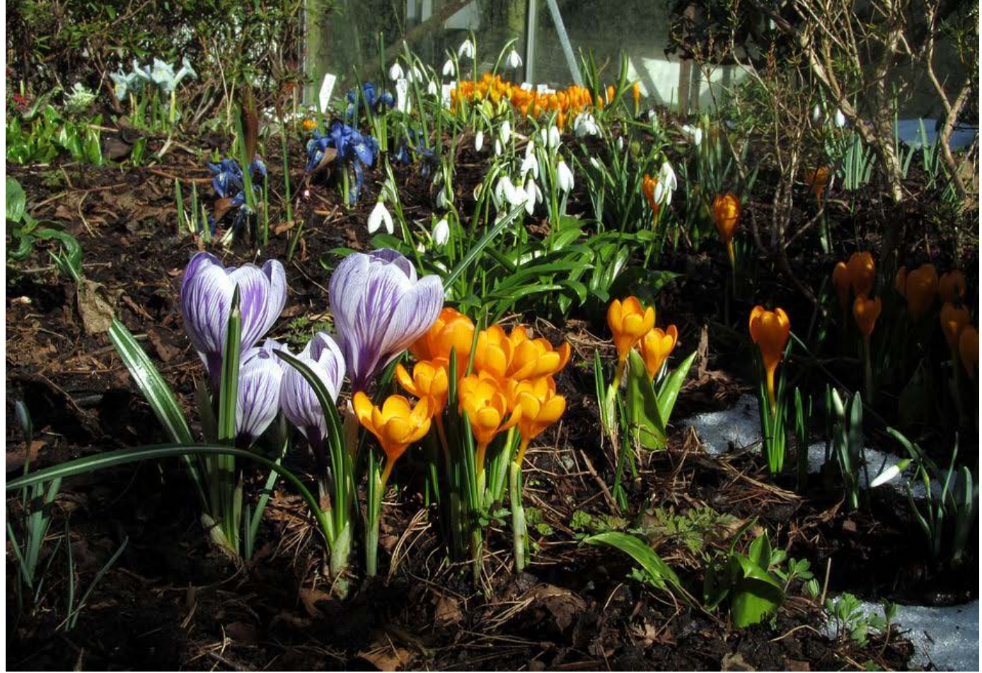
The large Dutch crocus is a survivor from our original planting of bulbs some 40 years ago – some are quick to deride these cultivars preferring the species such as the gloriously yellow Crocus herbertii above. I try not to be a plant snob enjoying all healthy plants be they common or rare and you have to be impressed that a number of these large Crocus cultivars are still gracing our garden after all those years.