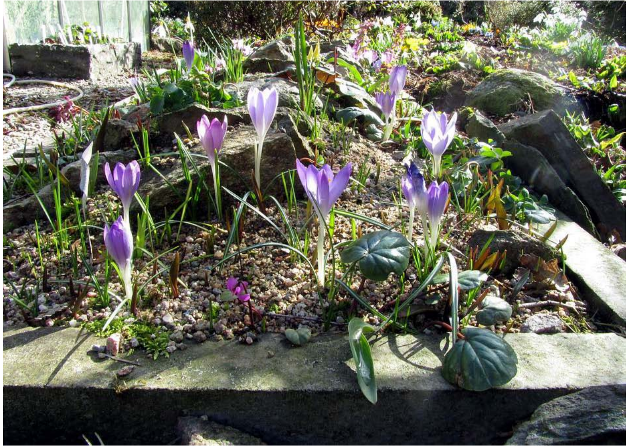
The Crocus especially enjoy the sunshine.