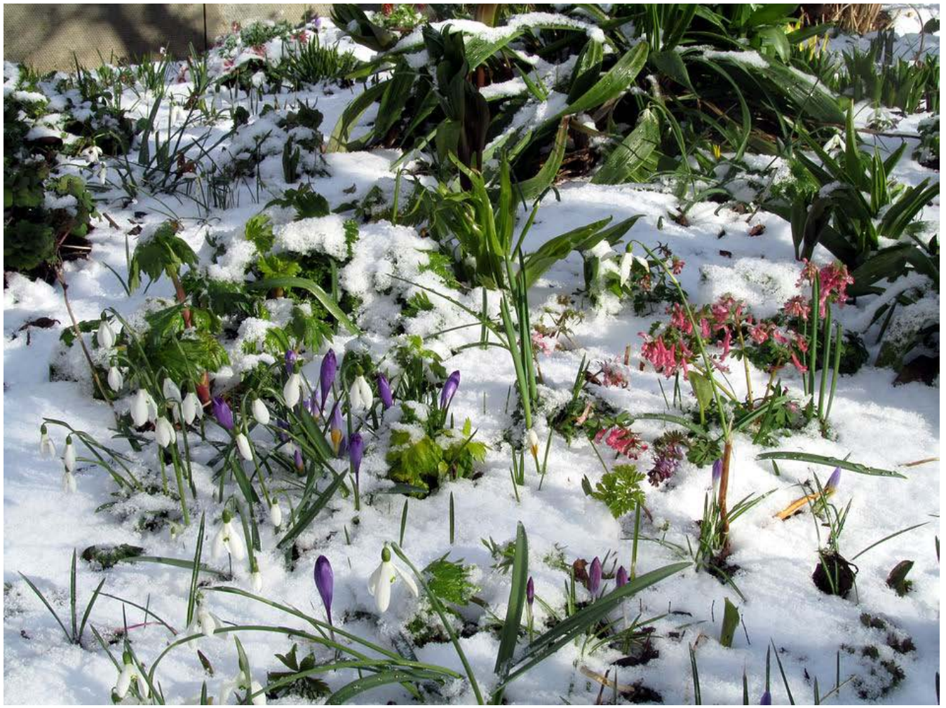
Like most of Northern Europe we are experiencing one of the coldest starts to spring for many a year - every day