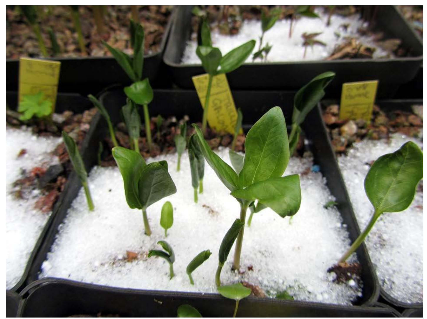
Here a group of young Trillium grandiflorum leaves are extending. Growing them unprotected in this way helps