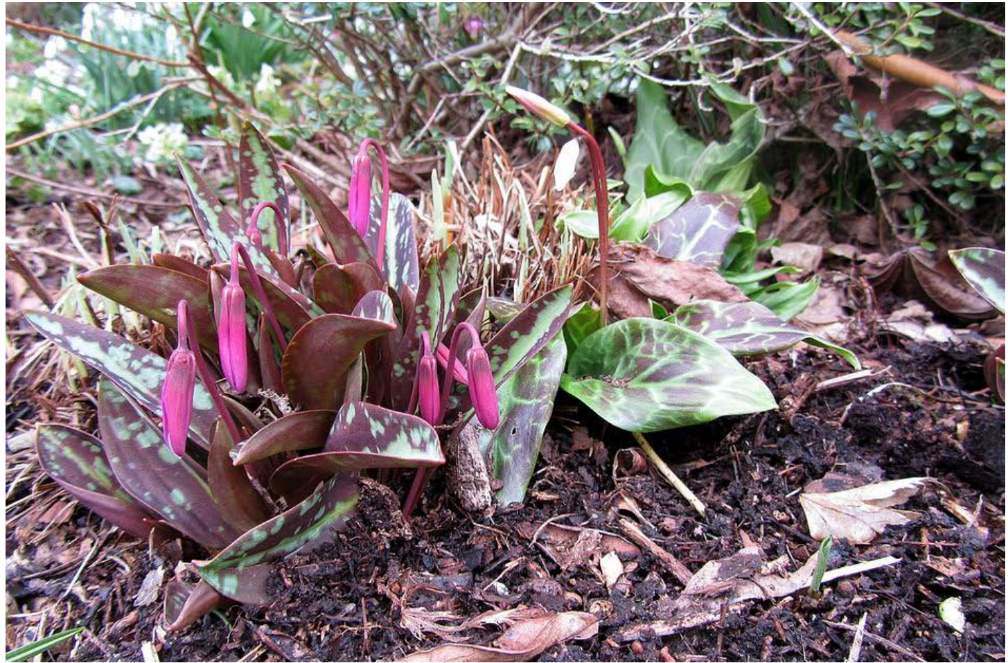
Erythronium dens canis and Erythronium revolutum have well developed flowers which will open when we get a bit more sunshine to warm the air.